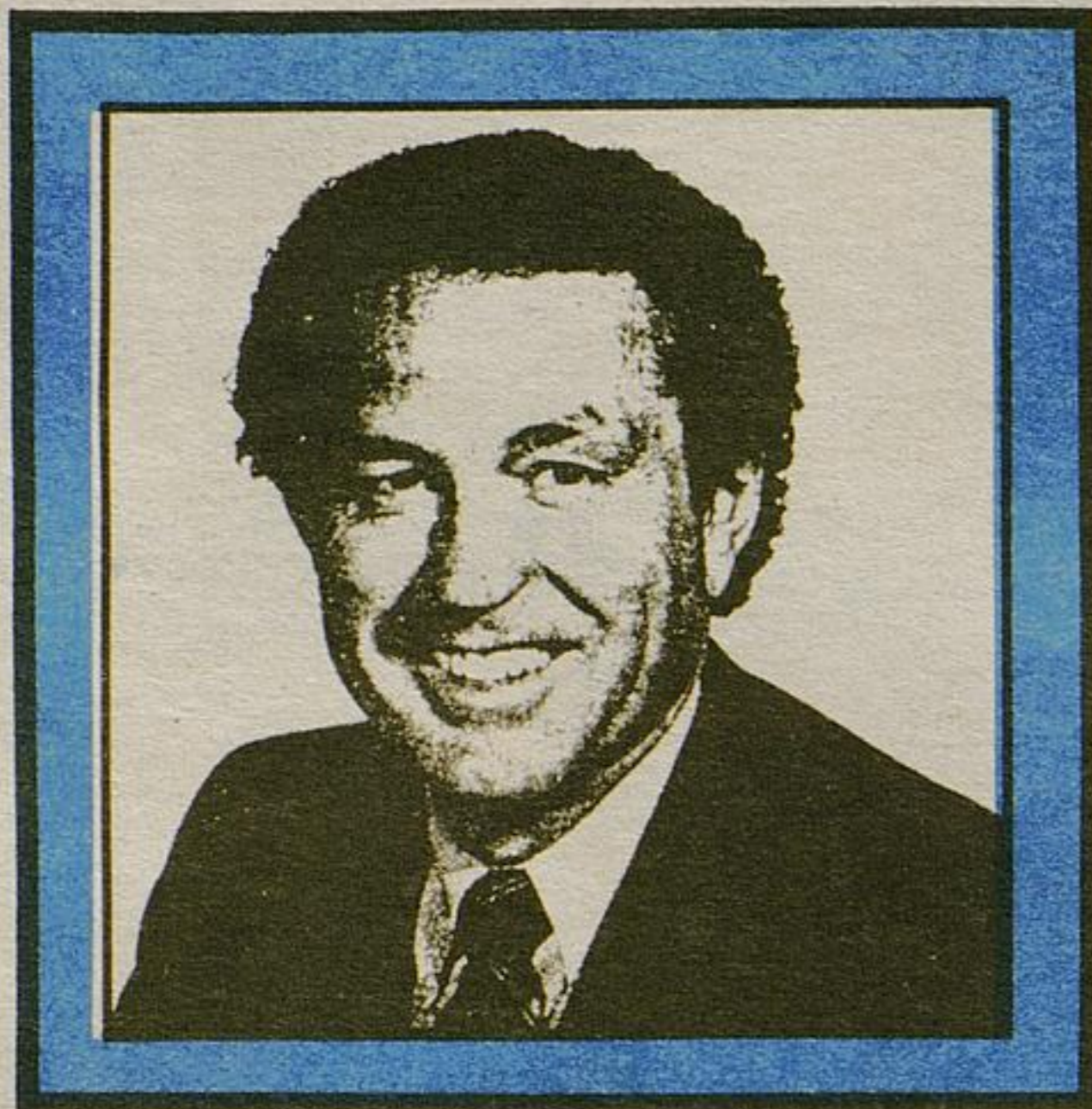
EDDIE SUTTON National Coach of the Year two times. His teams have appeared in nine consecutive NCAA tournaments

Dan Issel, Kyle Macy, Sam Bowie, Melvin Turpin and other former Wildcats will be special guest lecturers.