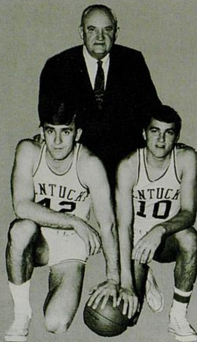
Coach Adolph Rupp with All-Americans Pat Riley and Louie Dampier