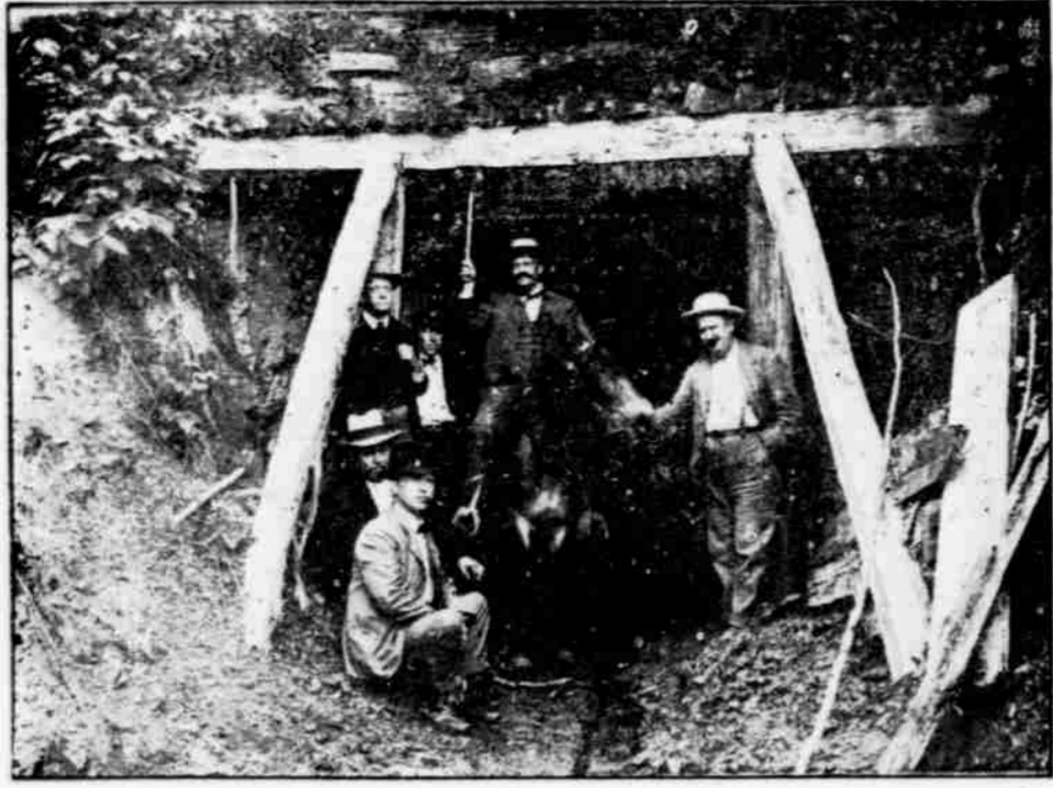
Coal Opening on Boone