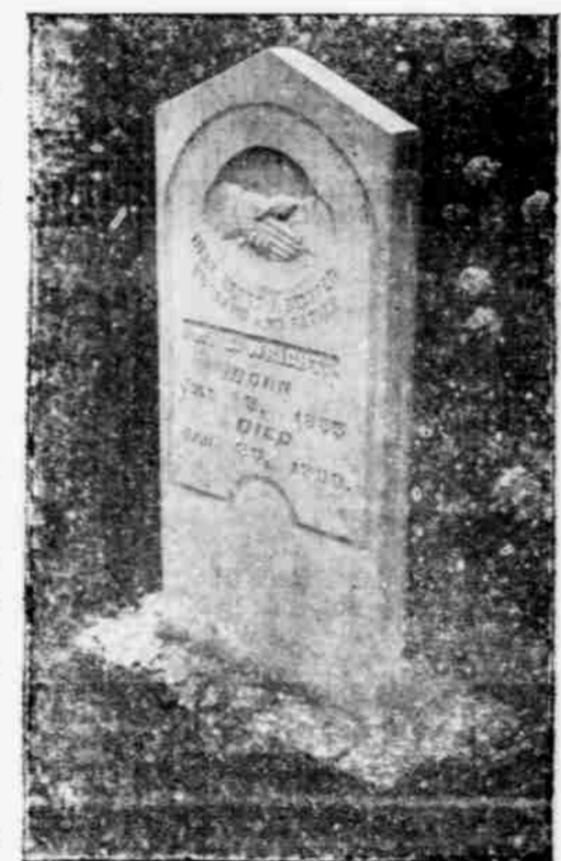
One of Many Styles of Tombstones

The Leader and Pioneer in this line in Eastern Kentucky