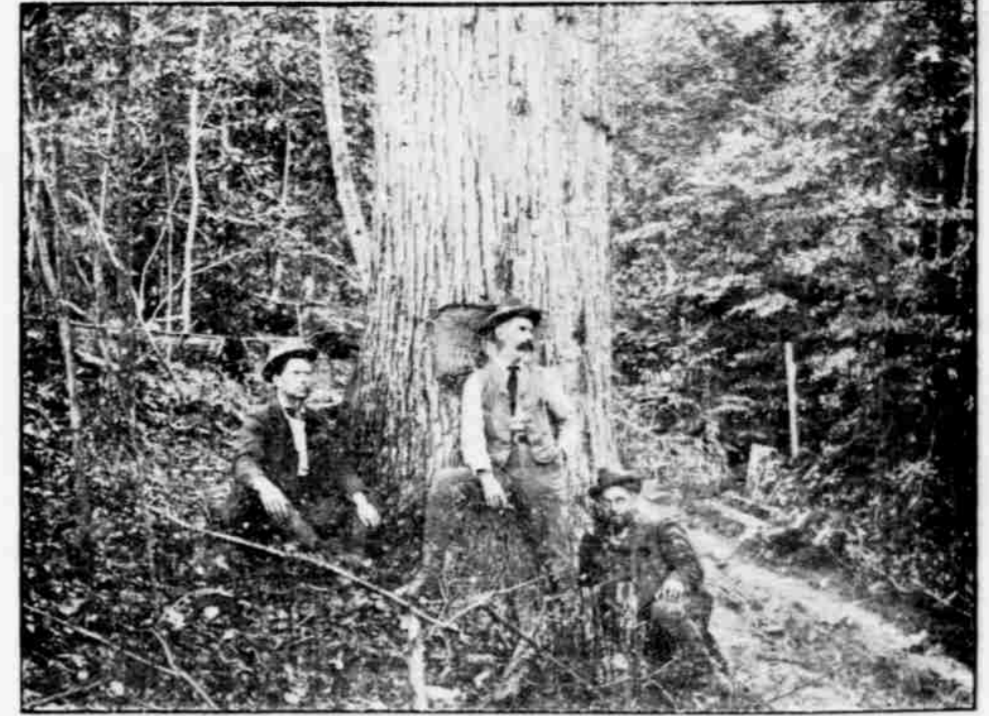
A Giant of the Forest on Wrights Fork