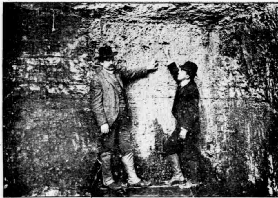
Coal Opening at McRoberts