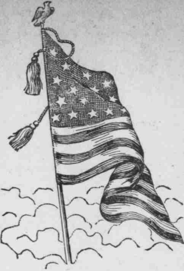
A Letter From Camp Collier.